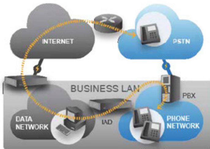
Traditional Phone Service

The diagrams below illustrate how SIP trunking works at a basic level. The yellow lines indicate the path of a voice call via a traditional PRI or analog line connection versus a SIP trunk.